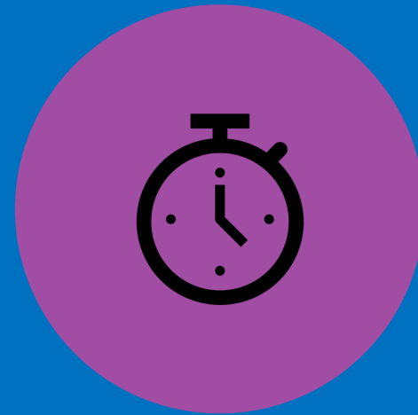
INFLATION REDUCTION ACT